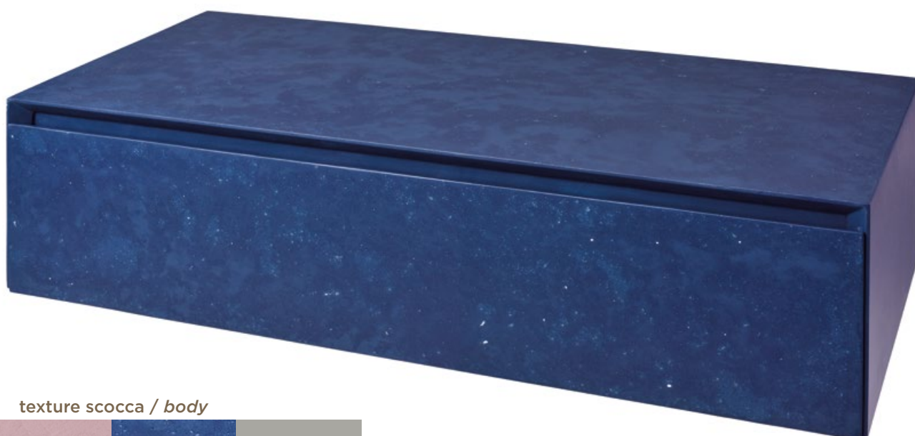
texture scocca / body